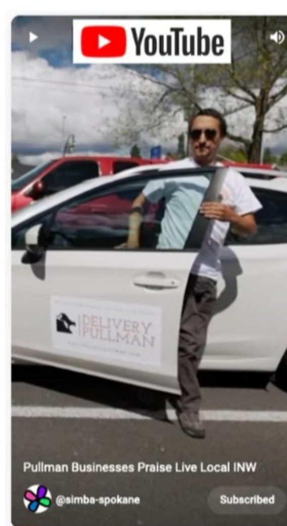
Click pic to watch 30 sec video!

We launched our Local Frequency loyalty rewards payment app pilot , created an e-pay protocol for eligible businesses to expand access to rural markets, and built a new website (launching in September) with new features and faster load speeds to better serve rural areas.